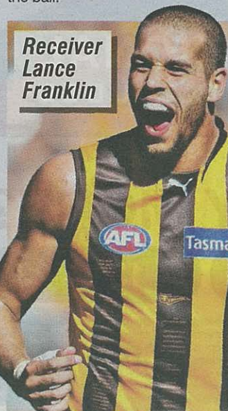
Receiver Lance Franklin